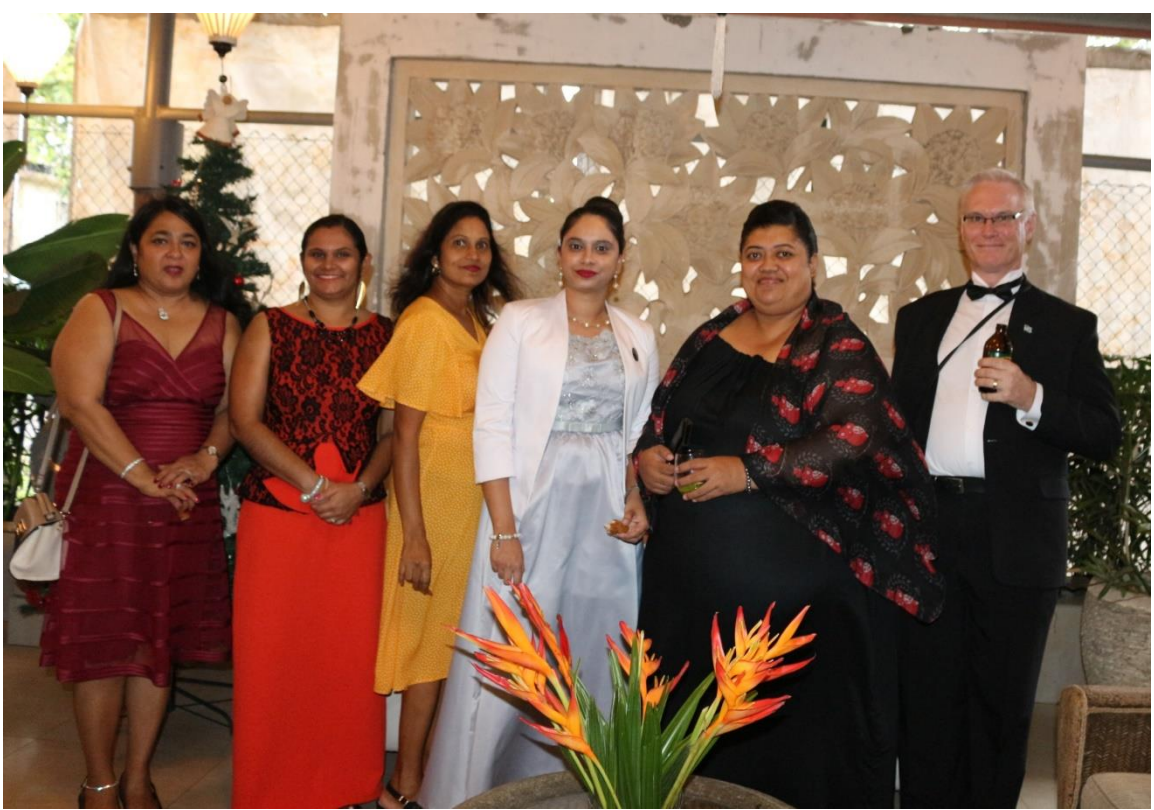
ODPP Prosecutors and Corporate Staff during the ODPP Black Tie Awards Night at Eden Bistro and Bar on Friday (27.11.20).