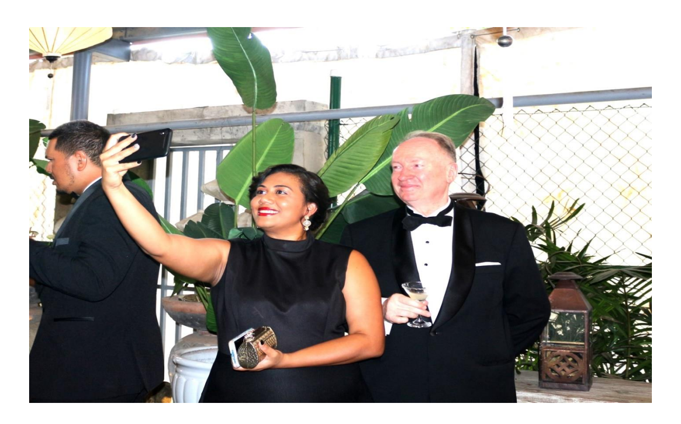
ODPP Prosecutors and Corporate Staff during the ODPP Black Tie Awards Night at Eden Bistro and Bar on Friday (27.11.20).