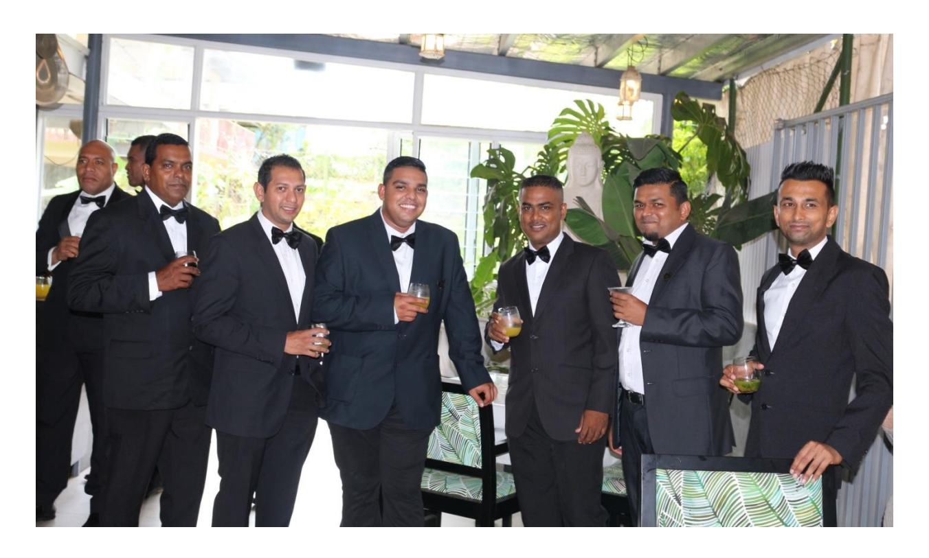
ODPP Prosecutors and Corporate Staff during the ODPP Black Tie Awards Night at Eden Bistro and Bar on Friday (27.11.20).