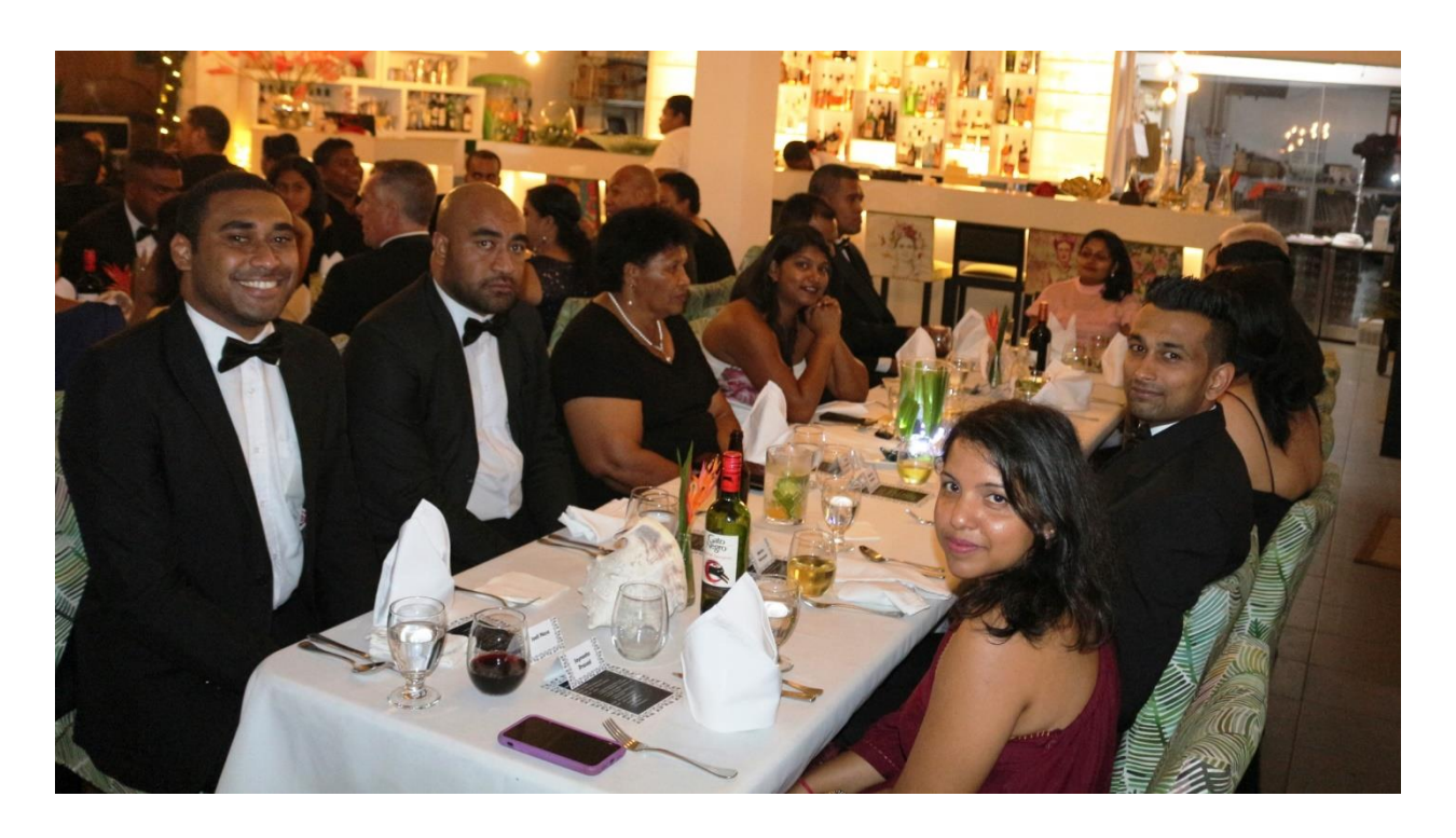
ODPP Prosecutors and Corporate Staff during the ODPP Black Tie Awards Night at Eden Bistro and Bar on Friday (27.11.20).