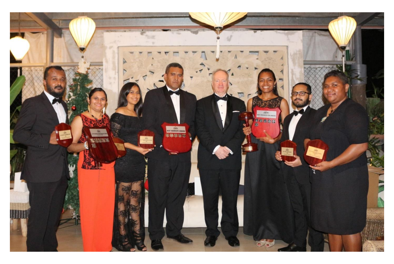
ODPP Prosecutors and Corporate Staff during the ODPP Black Tie Awards Night at Eden Bistro and Bar on Friday (27.11.20).