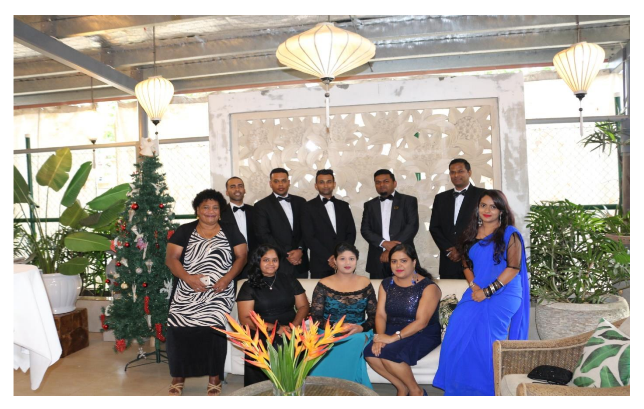
ODPP Prosecutors and Corporate Staff during the ODPP Black Tie Awards Night at Eden Bistro and Bar on Friday (27.11.20).