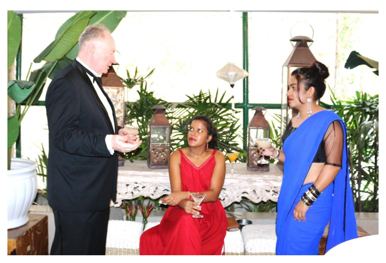
ODPP Prosecutors and Corporate Staff during the ODPP Black Tie Awards Night at Eden Bistro and Bar on Friday (27.11.20).